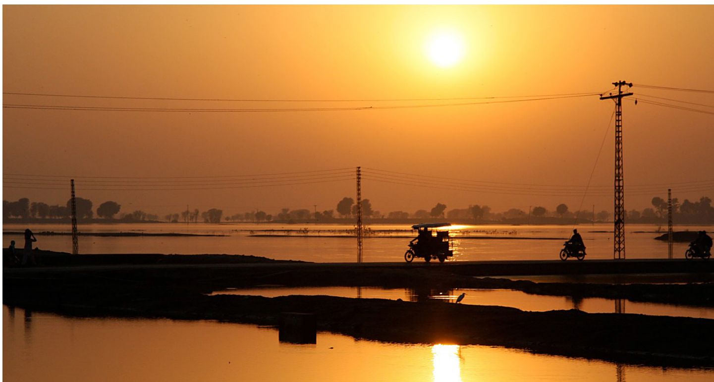
The sun sets on the flood-waters in Dadu, one of the most heavily affected regions where seemingly endless flood-waters have been slow to recede and huge numbers of people remain displaced – Jonathan Brooker – North of Dadu, Sindh – SOLIDARITÉS INTERNATIONAL – 17/12/10