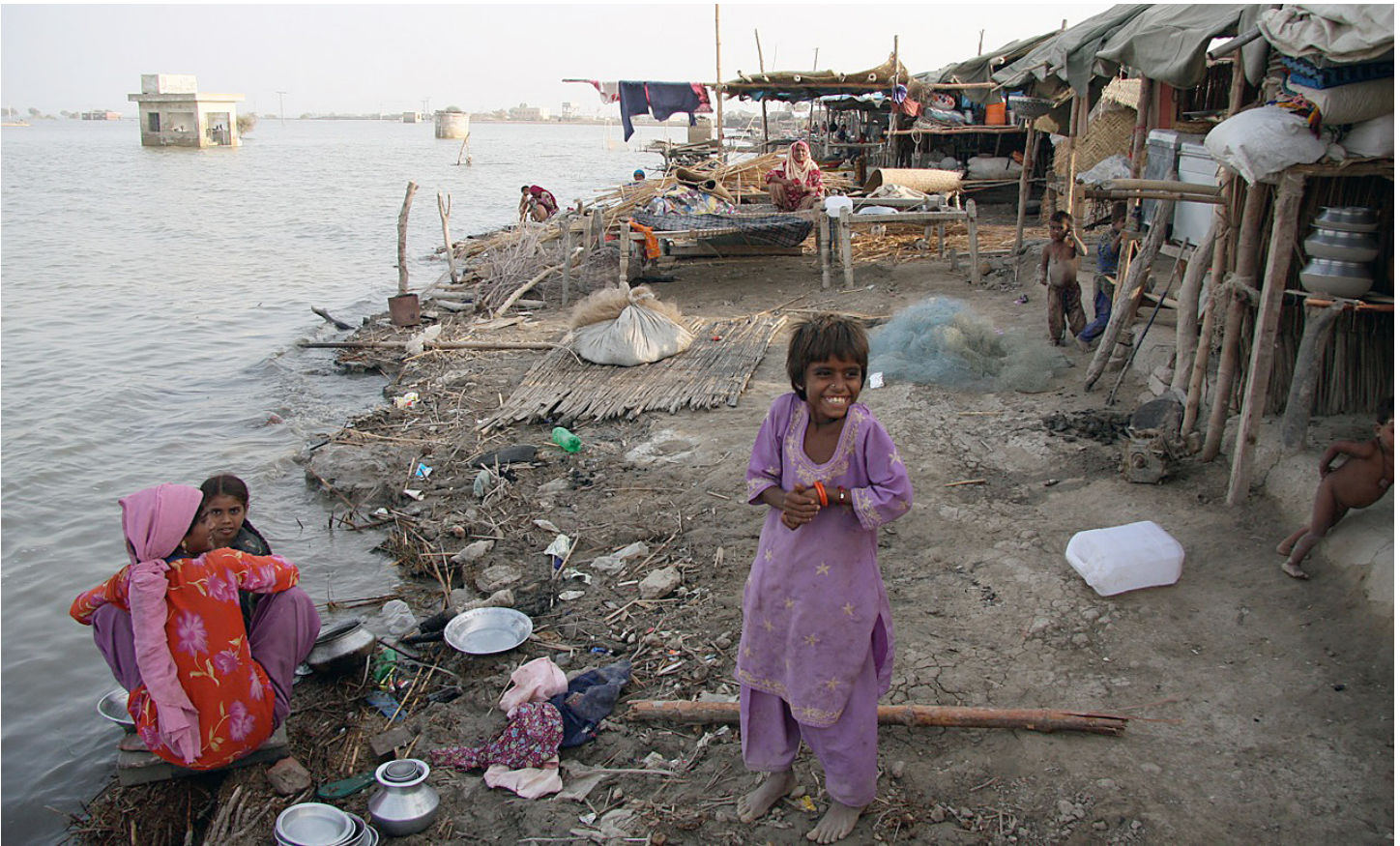
Living on the edge of the flood-waters, many families did not have the opportunity or did not want to go into camps, concerned about being far from their water-submerged homes or not having transport available to get to camps