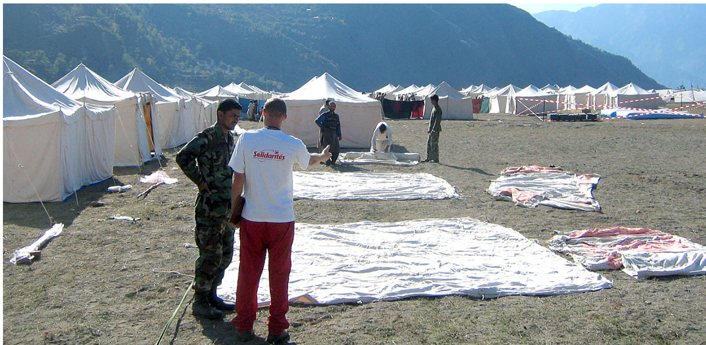
The Mera Camp, Swabi district, KPK – 05/11/2005

And theoretically humanitarian actors have the “soft” know-how on protection of vulnerable groups such as children under five or women and on ensuring equity among different communities or recipient groups. 11