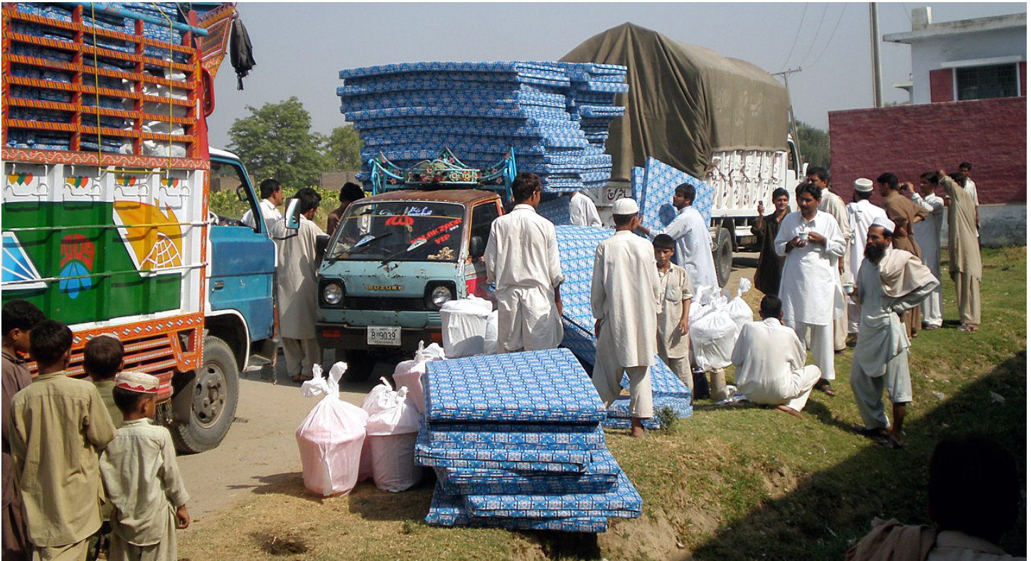
Hygiene and Non Food Items distribution in the district of Swabi, KPK, after the mass displacement from the Swat Valley and before the return of people – 02/07/2009

in Karachi, Lahore, Mingora (Swat), and in the FATA. Their budget grew from approximately $20 million in 2008 to $100 million in 2009 and $130 million in 2010 (before the floods); the number of their employees grew from 200 in 2008 to 1,300 in 2010. 18 Many NGOs also scaled up their presence.