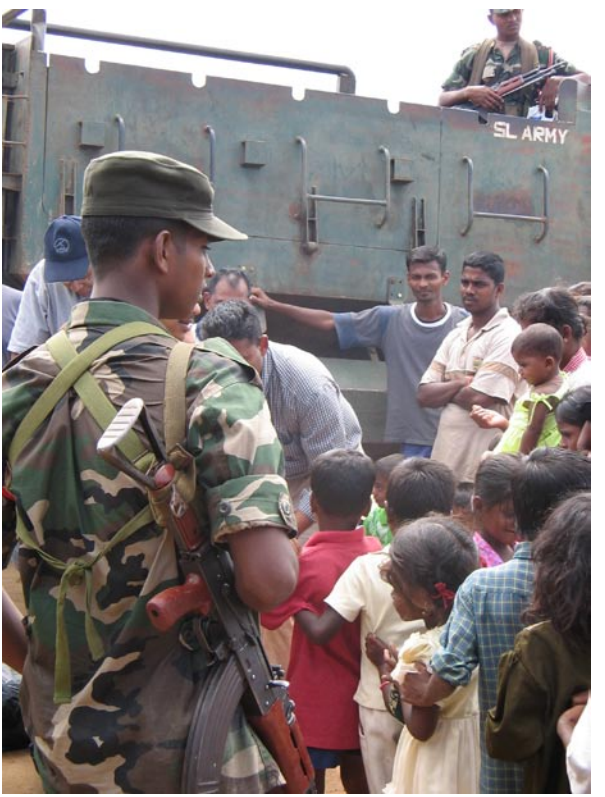
Local volunteers distribute aid to displaced children.

The notion of universality in the provision of humanitarian assistance by international organizations in Sri Lanka is frequently an ambiguous, contested and highly politicized concept that closely interlinks with how foreign humanitarian actors are viewed in relation to this study's three other themes of coherence, security and terrorism. The above comments reflect the general spectrum of opinion on international humanitarian assistance and reveal the extent of confusion that exists regarding the underlying motives of aid. Although neither the right nor the responsibility of the developed world to assist Sri Lanka as a country affected by poverty, conflict and natural disaster was widely challenged, many respondents felt that at best there was a lack of clarity concerning international humanitarian objectives, and at worst, that this humanitarian mist masked some more sinister agenda that was frequently linked to a bias in favor of the LTTE.