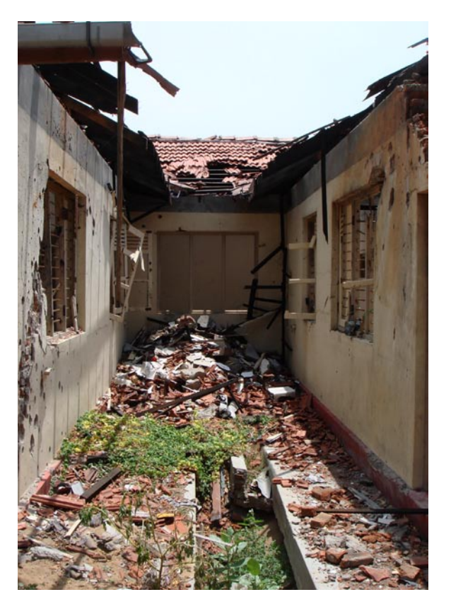
A war damaged hospital building.

Sri Lanka, formerly Ceylon, has experienced almost forty years of violence and disaster. Early promises of prosperity as a role model for south and south-east Asian development were undermined when populist policies pandering to the nationalist post-Independence sentiments of a newly empowered Sinhala Buddhist majority helped lay the foundations for a future of successive political crises. A brutally repressed southern Marxist youth insurrection in the early 1970s was followed by the emergence of militant Tamil nationalist aspirations in the north, which ultimately condemned the island to a protracted secessionist struggle that has continued unabated, save for the brief hiatus of a fragile ceasefire, from 1983 through to this day. During this period of conflict in which some 70,000 people have died and hundreds of thousands been displaced, Sri Lanka has also had to contend with the fiasco of a failed Indian peace-keeping mission, a second southern insurrection and a devastating tsunami disaster which killed over 35,000 people, wrecked almost sixty percent of the coastline and left half a million families homeless.