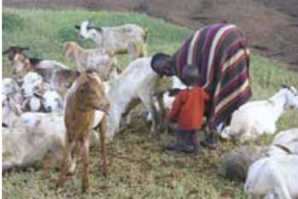
Milking Maasai goats, Tanzania

producing milk. The use of yaks in Tibet is an example of this strategy, but here again, mixed herds are used comprising yaks and sheep (Nori 2004). In Afghanistan, Kuchi pastoralists rear mixed herds of cattle, sheep and goats, with some also keeping camels and donkeys for transport (Fitzherbert 2007).