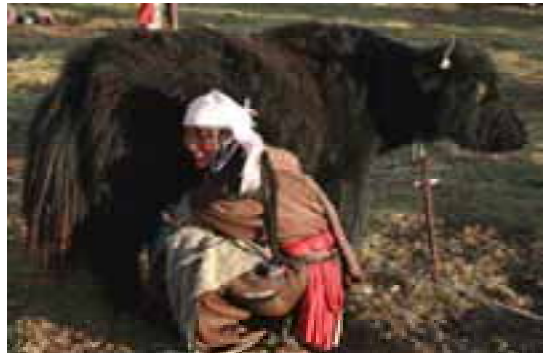
Milking a yak on the Tibet-Qinghai plateau