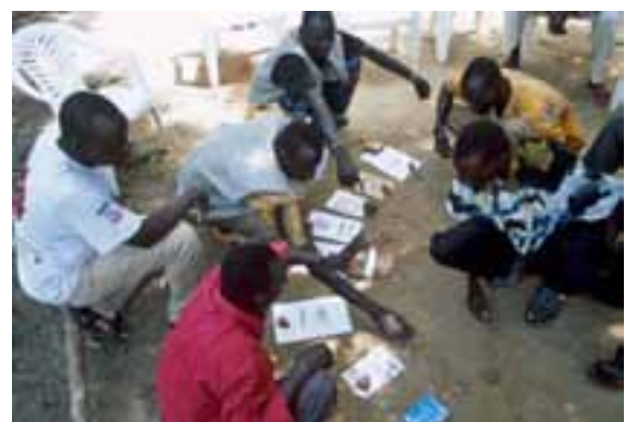
Research in South Sudan on the livelihoods and nutritional impact of foot-and-mouth disease

Using participatory methods in South Sudan, Nuer herders estimated milk losses in cattle due to acute foot-and-mouth disease at 1.6 liters per day (95% CI 1.20, 1.95 liters per day) for an average of 14 days; this represented a 62% fall in production in affected cows during the period of clinical disease (Barasa, Catley et al. 2008). By combining this information with estimates of disease incidence by age group, the reduced volume of milk available for human consumption due to foot-and-mouth disease (FMD) was estimated at 839 liters per household. Assuming intake of no other foods,