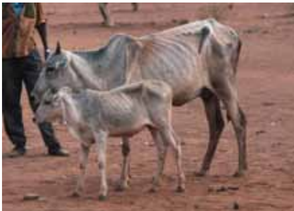
Trypanosomiasis causing emaciation and reduced milk production in cattle, Somali region of Ethiopia