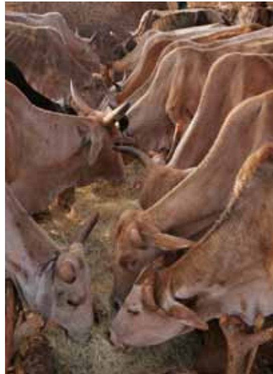
Supplementary feeding of cattle during drought in Borana areas, southern Ethiopia

2008 SCUS implemented a supplementary feeding project in Borana based on 10 feeding centers with 6,750 cattle (Bekele and Tsehay, 2008).