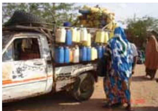
Transport of milk from southern Ethiopia for sale to Mendera

This (milk) chain is entirely local and in the hands of women milk traders, called abakaar. It manages to handle between 1.5 and 5 tons of camel milk, daily, reliably, and at an affordable price, from highly mobile nomadic camel herds 100-150 km from Mogadishu. It does so without any