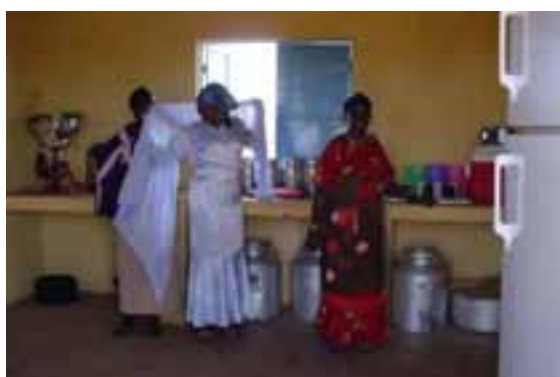
The Loglogo women's dairy in northern Kenya

In northern Kenya, an OFDA-funded project implemented by Tufts University and AU/IBAR supported women's groups to set up small dairies for processing and sale of milk. The intervention was assessed in terms of the viability of the dairies as small businesses and recent development includes the commercial sale of camel milk for packaging and supply to local supermarkets and for export (Odhiambo 2006).