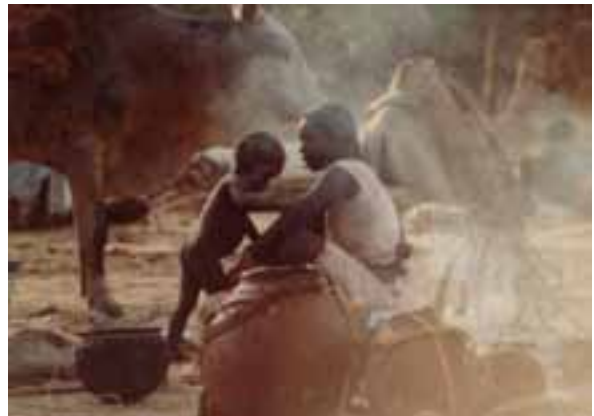
Baggara Arab nomad with milk containers, Darfur

Daniel Sellen's longitudinal studies on the Datoga found that supplementary foods fed to infants and young children included fresh and soured goat or cow's milk, maize-meal gruel and the principal adult staple, stiff maize-meal porridge; that the median ages of introduction of non-human milks, introduction of grain-based solids, and cessation of breast-feeding were 2, 11 and 20 months respectively; and that feeding practices show a lack of concordance with international standards.