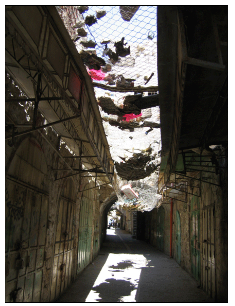
Closed Palestinian stores in H2, the Israeli-controlled area of Hebron.

our future." Palestinian freedom of movement, even within the West Bank, is restricted by various mechanisms: earthen barriers, ditches, trenches, gates and terminals between Israel and the West Bank.<sup>5</sup> In