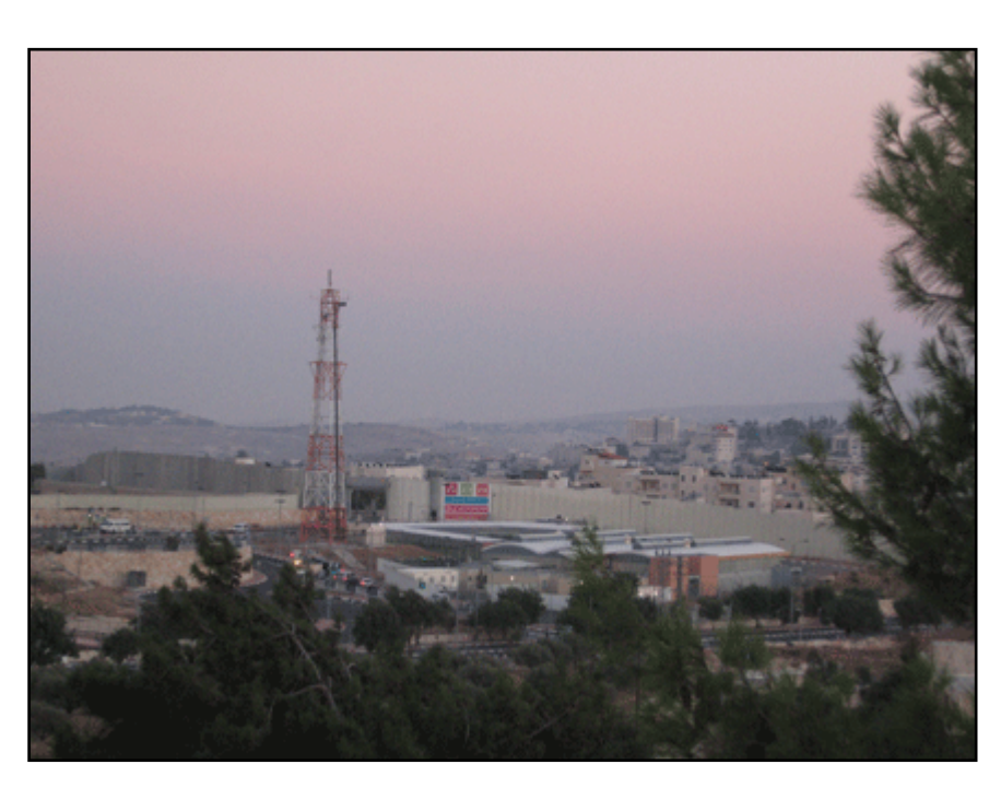
Israeli checkpoint from Jerusalem to Bethlehem.