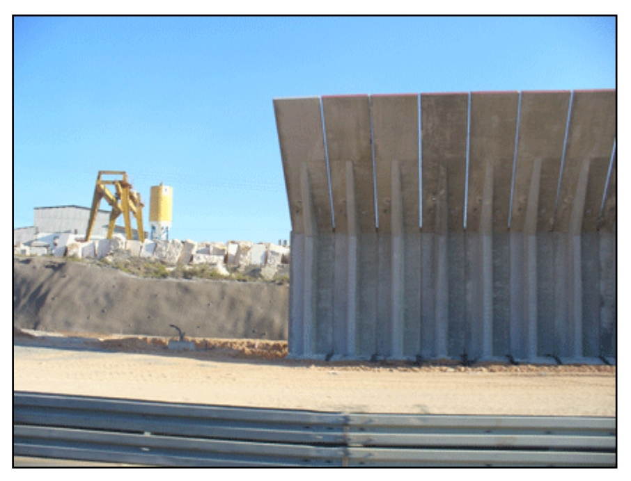
West Bank barrier, in progress.

Many of the humanitarian actors interviewed for this research admitted a sense of discomfort (and some resignation) with the idea that their work indirectly or directly allowed Israel to shirk its responsibilities under international humanitarian law (IHL) to provide for the Palestinian population that lives under Israeli occupation. <sup>22</sup> As a result, the central humanitarian issues are access and protection. The bandaid critique is not new or unique to the oPt, nor is it likely to disappear without a comprehensive peace agreement. As one interviewee summed