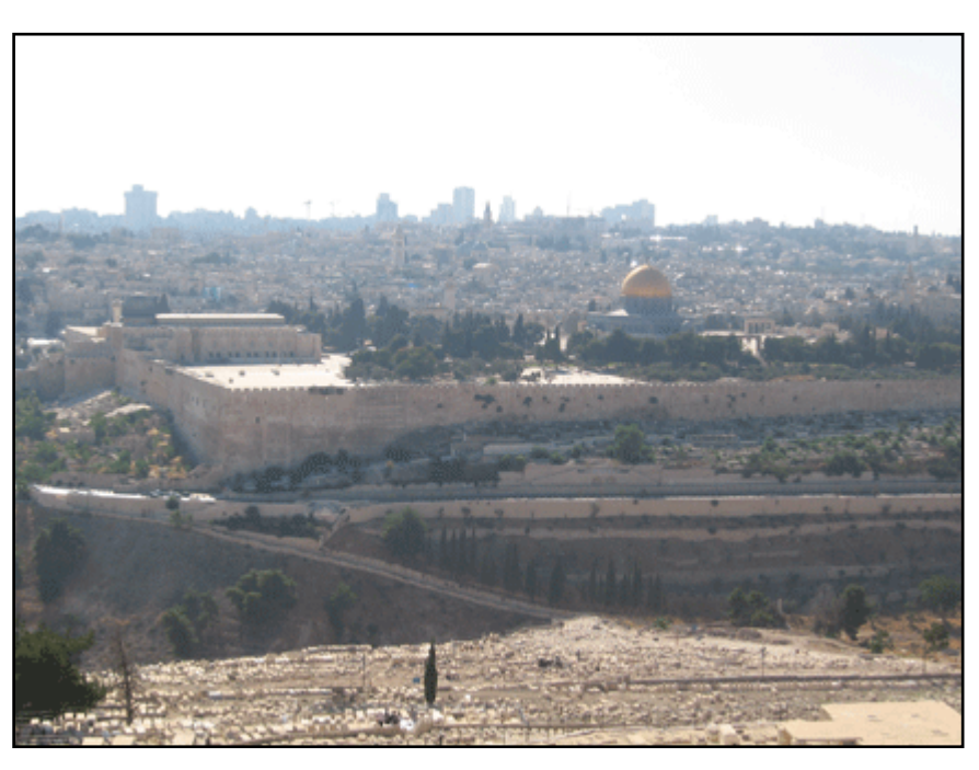
Jerusalem.

response. Yet this same response is ineffective against the broader systemic issues of the conflict, raising questions about the extent to which a humanitarian response has facilitated the occupation by not allowing the situation to get "bad enough" to force a political settlement. It also raises questions about the ability of the