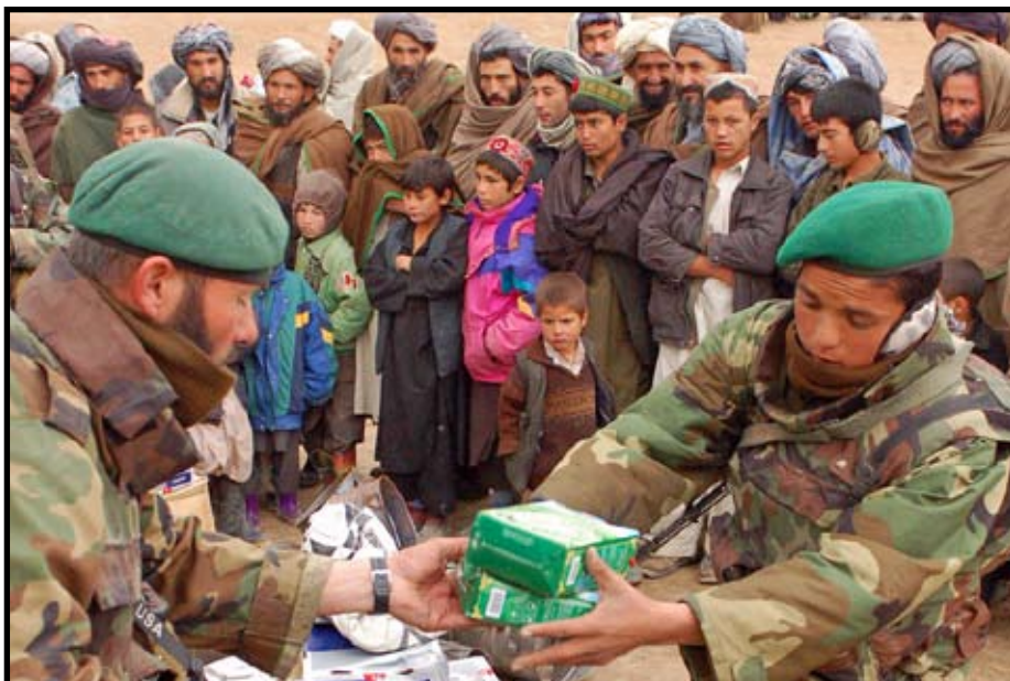
ANA soldiers deliver assistance in Qaysar district (Faryab province) in Dec. 2007 as part of the Coalition “information operation” mentioned on this page.