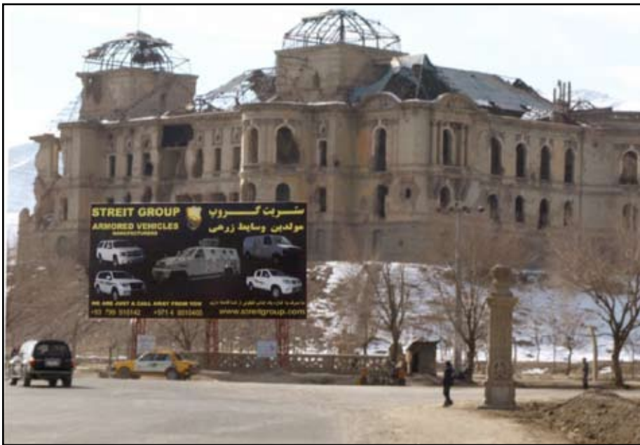
Darulaman palace, Kabul, January 2009.