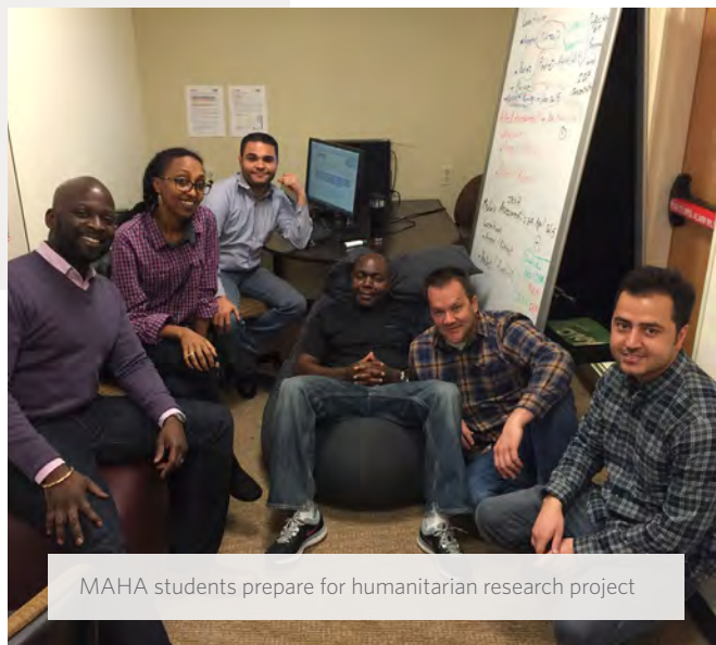
MAHA students prepare for humanitarian research project

In 2017, the Professionals in Humanitarian Assistance and Protection (PHAP) group added the MAHA to its growing group of affinity members. This partnership means that PHAP members receive a discount on tuition costs.