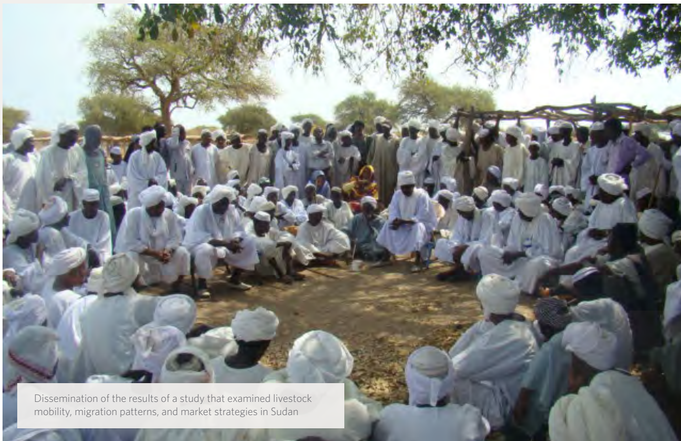
Dissemination of the results of a study that examined livestock mobility, migration patterns, and market strategies in Sudan

The Feinstein International Center is committed to public impact and to ensuring the use of research in humanitarian decision-making, policy, and practice. In this section, we share selected narratives about the reach of our work between July 2015 and June 2017. Further, the Feinstein International Center team has engaged in numerous public events, government briefings, and media appearances—alongside participation in academic conferences and publication in academic journals—to disseminate its work. Highlights from these events between July 2015 and June 2017 are presented below. A detailed listing of Feinstein International Center publications during this time period can be found in the Annex.