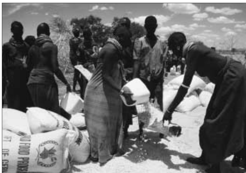
A WFP food aid distribution in Turkana

Overall, donors provided close to $4m for these livestock interventions between June 2000 and January 2001. Major donors included the Community Development Trust Fund (CDTF), a European Union (EU)/ Kenyan government poverty-reduction programme; the EU itself; the UK's Department for International Development (DFID); and the US Agency for International Development (USAID). Of this $4m, nearly $977,000 was disbursed for destocking or off-take; $1,159,000 for animal health; $119,000 for transport