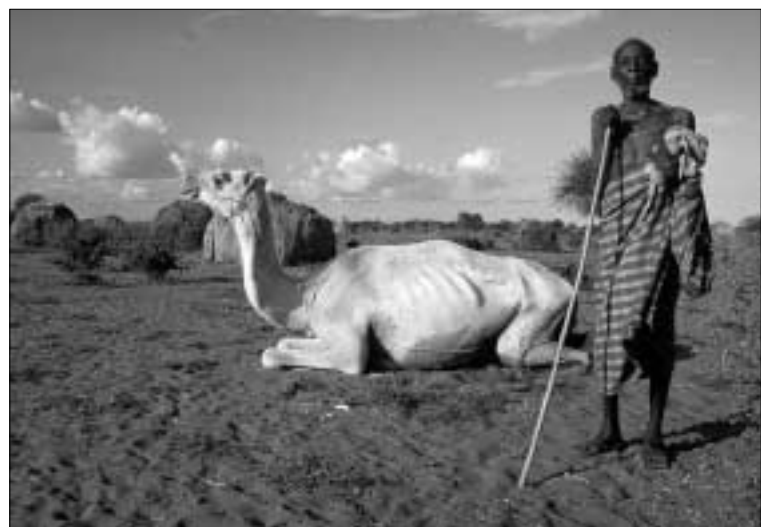
In the Turkana destocking intervention, camels were seen as too valuable to be slaughtered

Women and youth groups targeted by the intervention benefited in terms of business and employment, with a total of KSh7.14m being injected into the economy. A total of 9,036 school children in 41 schools benefited, while TB patients in the district hospital were given the meat in their meals. In addition, the intervention created cohesiveness in community groups and caused them to feel proud that meat from their animals could be used to feed their own children. The impact on water and pasture resources was, however, negligible.