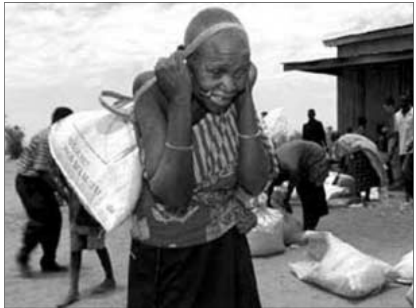
Food aid being collected at a WFP distribution centre, September 2000

standard general indicators often collected by centralised national systems. Indicators are selected to pick up changes in the environment, local economy and human welfare.