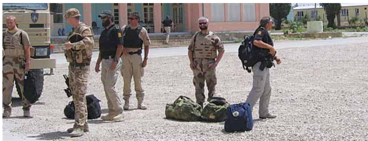
Norwegian soldiers at the airport in Maimana

Unlike other PRTs, the Norwegians do not have civil-military cooperation (CIMIC) 65 projects or a CIMIC advisor in the camp. Norwegian funding for development in