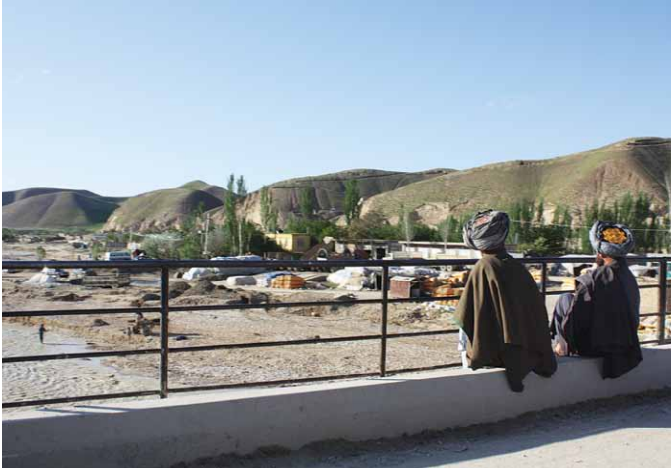
The bridge over the Maimana River

Ghormach is included as a mini case study in this research because it has been identified as one of the “focus” or “swing” districts in the UNAMA-led Integrated Approach described above. In addition, the Norwegian government has invested a large amount of money (approximately $4.5 million at the time of research) in aid activities in the district under the rationale that increased aid will lead to increased stability.