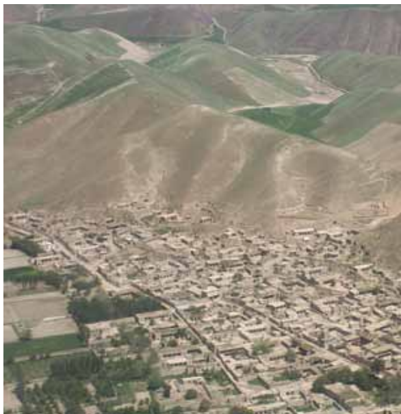
Part of Maimana, aerial view

By the fall of 2007, ISAF was compelled to act in response to the increasing Taliban activities in Faryab, which was an obvious spillover from Badghis. The impetus for action emanated from the Norwegian PRT in Maimana and the German Regional Command North based in Mazar, not the Spanish PRT based in Qala-i Now or its command based in Regional Command West, Herat. Their concern mirrored that of many Faryabis and many other communities in Badghis who viewed the unchecked ascendance of the Taliban with justifiable concern. For example, the Daudi Aimaqs from Jawand who had come under attack petitioned for arms for self-defense. While an ISAF-ANA operation (Harakat-i Jolo) conducted in October-November 2007 was presented as a tactical success, it was generally viewed as a strategic failure: the majority of the Taliban had opted not to fight and relocated to higher ground. ISAF and ANA forces were in the field for only a short period, leaving the Taliban largely unaffected and able to return once they withdrew. They failed to meet one of the objectives of the operation—to generate the space for reconstruction activity—as the security situation remained unstable. Repeat operations have been necessary—in May 2008 (Operation Karez) and October 2008—and the level of