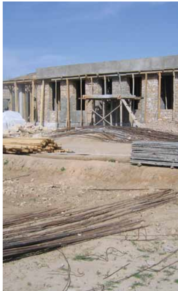
School construction in Khwoja Namusa, Pashtun Kot

After an analysis of the historical and sociopolitical background needed to understand the findings in their appropriate context, subsequent sections of this report will present findings on the perceptions of drivers of insecurity and of aid projects and actors. The paper then discusses development initiatives and their impact on stability, including the ERP and a mini case study on Ghormach, a district that has been an important focus for the international community in terms of stabilization. The paper ends with a summary of conclusions, along with policy implications.