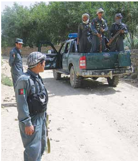
ANP officers in Sar-i Howz, Pashtun Kot

switching allegiance from one party to the other based on perceived opportunities. On the other hand, an increasingly potent insurgency and the weakness of the ANSF have made the government more dependent on former commanders to fend off anti-government elements. In Shirin Tagab and Dawlatabad, for example, the local population resisted giving zakaat and uzhr to the insurgents. When men identifying themselves as Taliban came to collect, people in Dawlatabad requested assistance from the district governor, who informed the ANP and the Taliban fled after the police arrived.