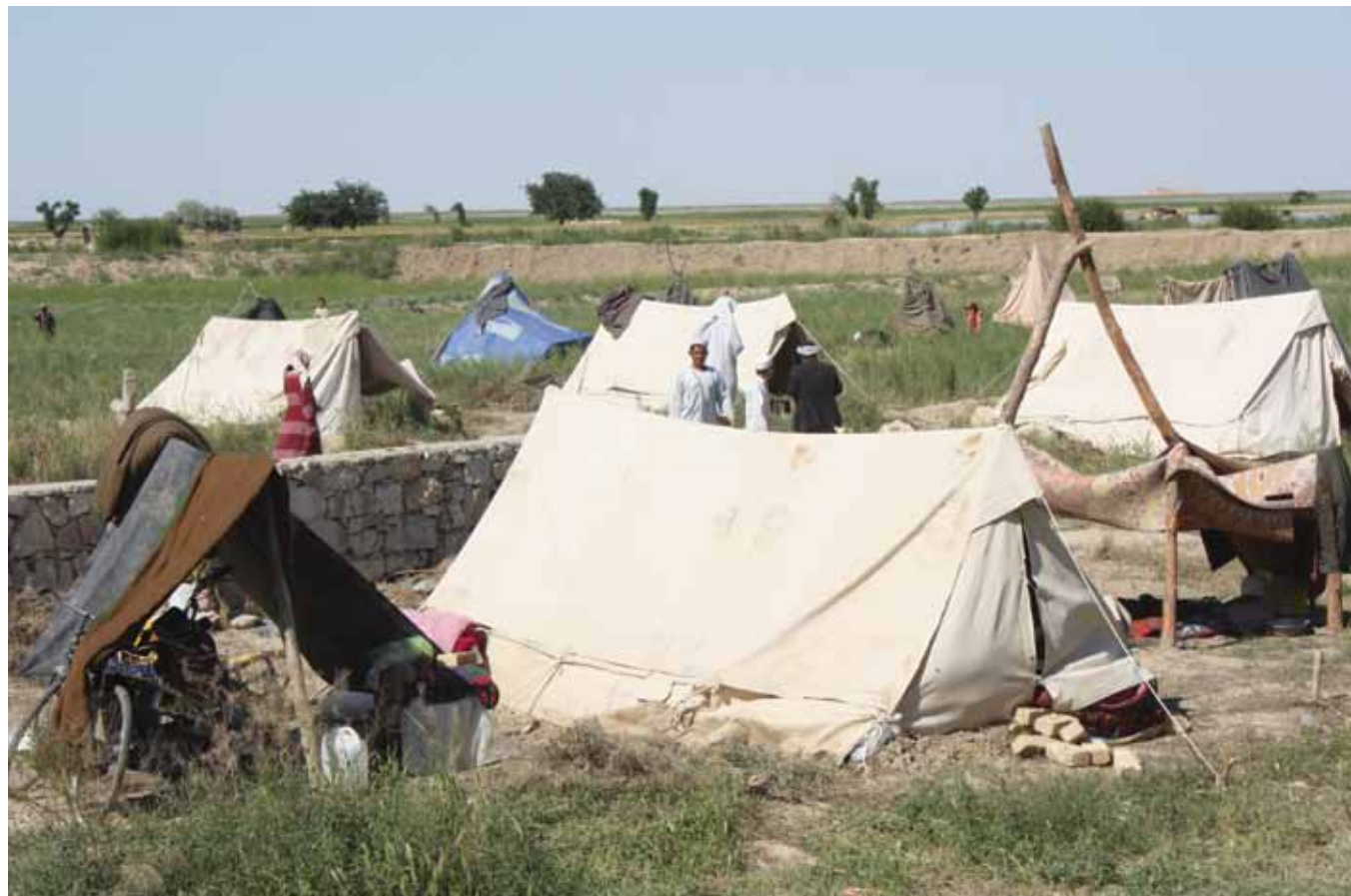
Families displaced by flood along ring road

According to a wide range of respondents, the drivers of insecurity in Faryab Province are varied, and include ethnicity, poverty and unemployment, factionalism, corruption and poor governance, conflict over scarce resources, ideology, and the existence of a “war economy” from which many actors benefit.