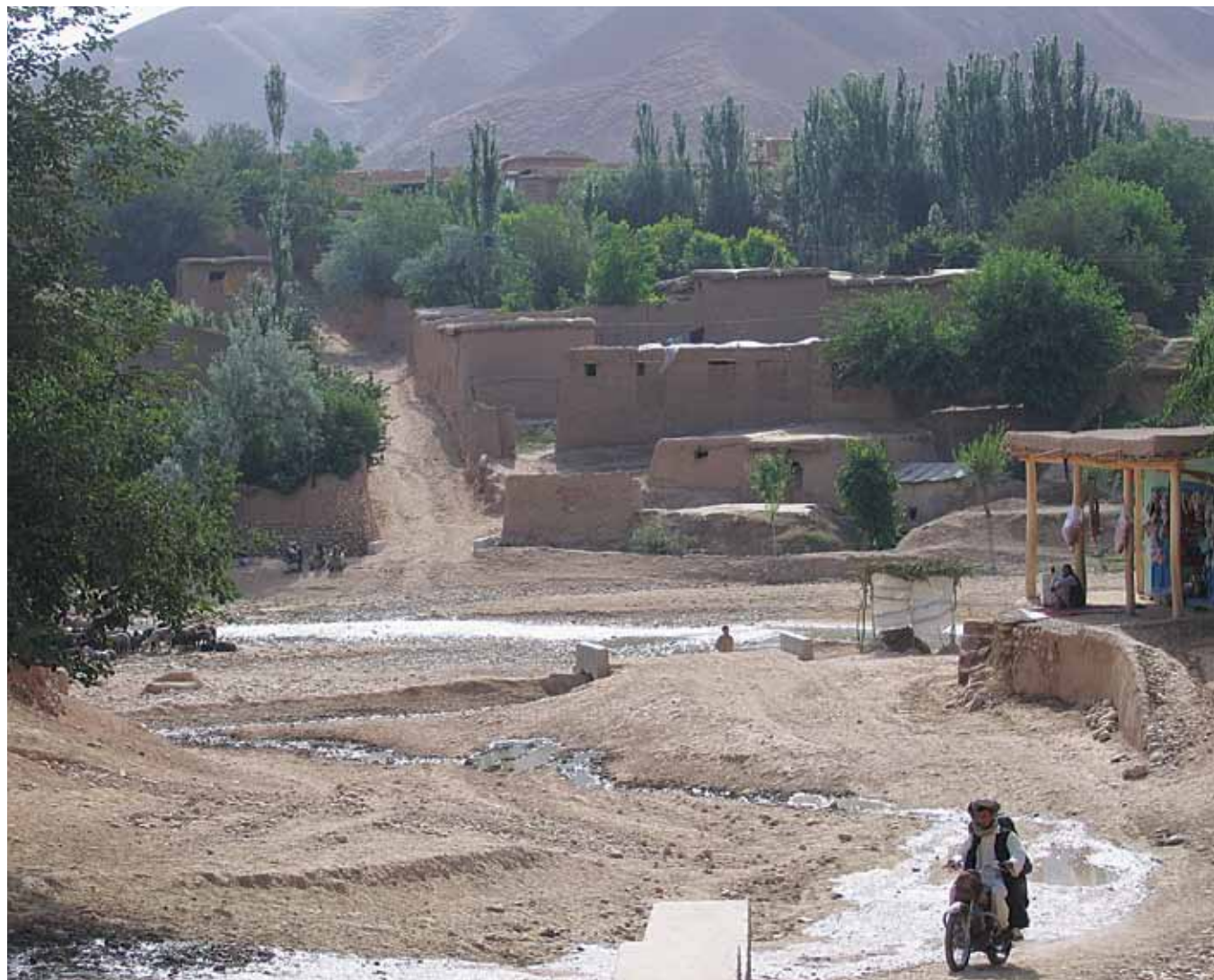
Village in Pashtun Kot

One initiative that has had a positive impact on stability in the province is the Peace and Reconciliation Association (PRA). It is particularly noteworthy as it offers a relative “success story” and a number of insights that are relevant in understanding how stability could be achieved in these specific contexts. As will be elaborated upon below, the PRA played a key role in largely political processes that increased stability in certain areas of Faryab, with a small or often even no role for aid.