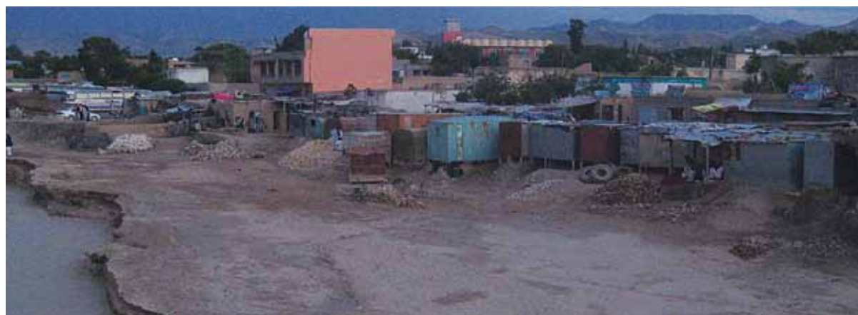
Maimana River at night

It was beyond the scope of this study to investigate exactly how poppy cultivation and drug trafficking benefited the insurgency, commanders, or individuals within the government. Drug trafficking, however, is having a significant impact on security. Some recent clashes are not necessarily political or Taliban-linked. The recent frequent incidents along the border involving attacks on the Afghan Border Police (ABP) are clearly related to drug smuggling and drug-related rivalries between local commanders. Narcotics play a larger role in Ghormach: both cultivation and trafficking is rife in the area, and those involved don't want any government presence or international troops that might jeopardize their business. Criminal elements have therefore joined forces with the insurgency because of their shared interest in keeping the central government out.