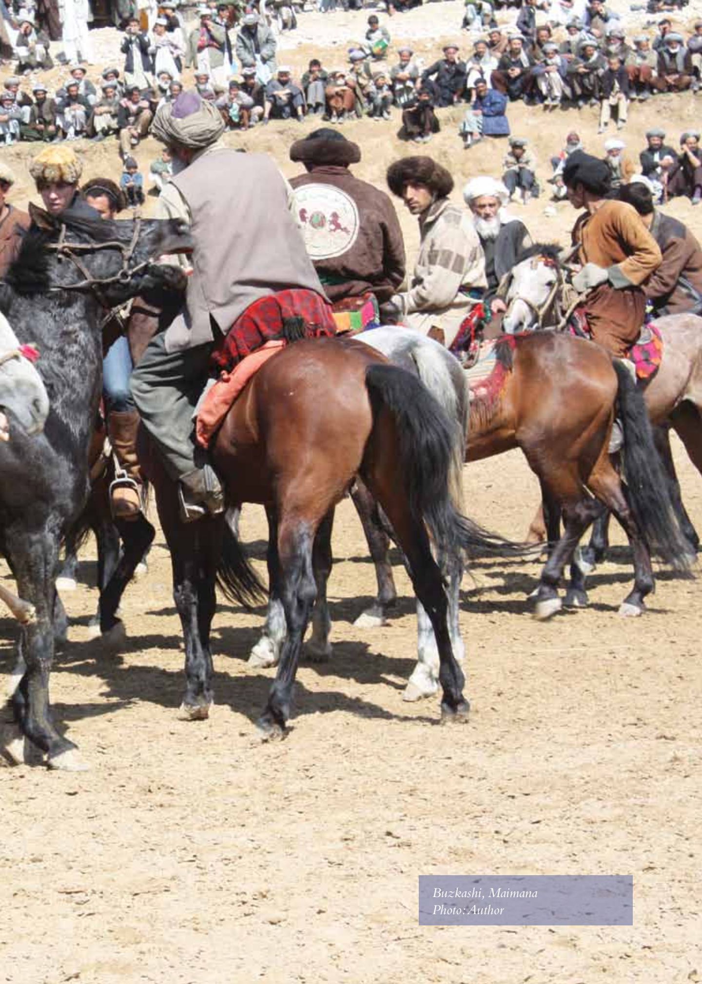
Buzkashi, Maimana